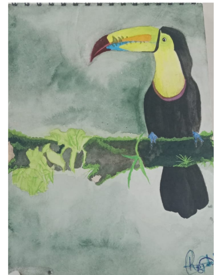
Raiqah - Grade 9