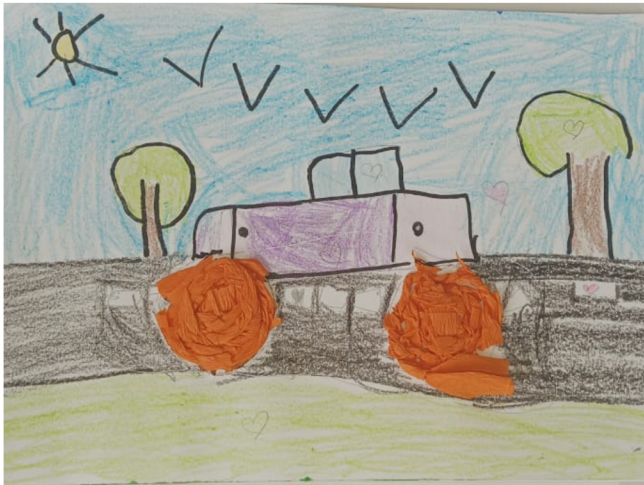
- Asmin, Grade KG 1 B