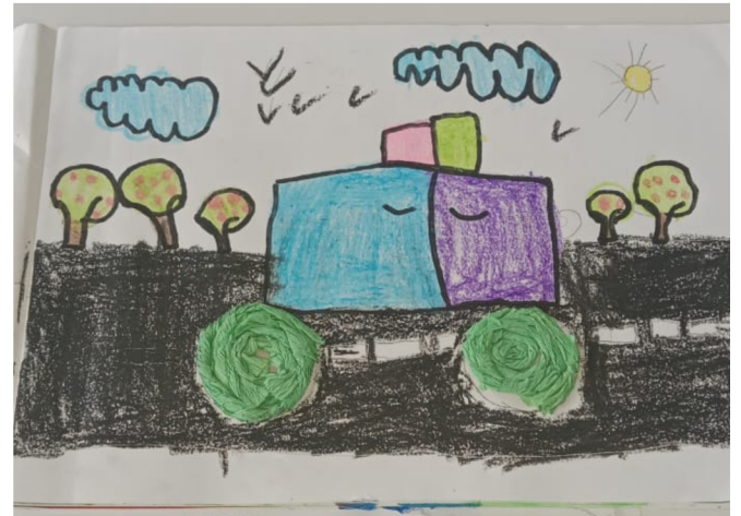
- Kayla, Grade KG 1 B