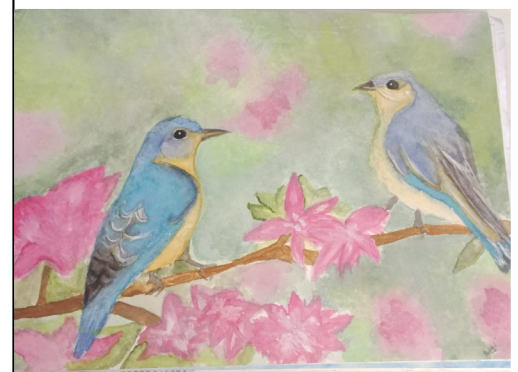
Eva - Grade 9